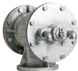
MARTIN® TORNADO Exhaust Valve is also available as a retrofit kit to upgrade air cannons supplied by other manufacturers.

Installation of BIG BLASTER® XHV Retrofit Valve Assemblies on established air cannon systems is available from Martin Services.